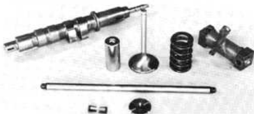
Valve action is controlled by Crane cam and springs, Smith pushrods, Wisemann tappets and stock rockers.