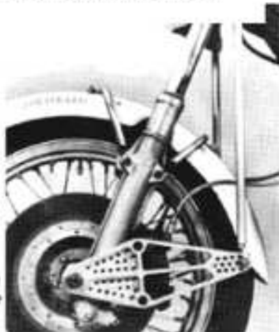
Glet's anti-dive, which keeps the bike level during braking, did away with cornering clearance problems