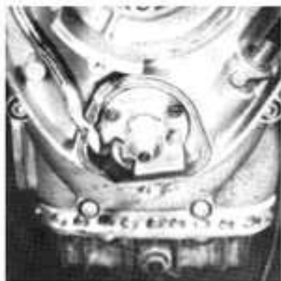
Total loss Bosch CDI ignition is timed by camshaft-mounted ceramic magnetic trigger. There are four coils.