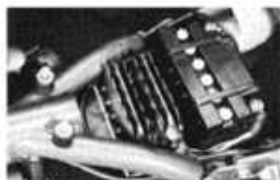
Crankcase volume control was finally taken care of by this large reed valve array, mounted under the seat.

from blanks, then matched them to the steel springs and damper units. The resulting shocks worked better than the former "works" monoshock had.