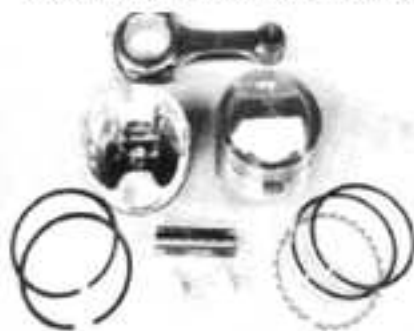
Thin-wall Venolia pistons, Amol Precision tool steel pins and Carillo rods have to be safe to 10,000 rpm.